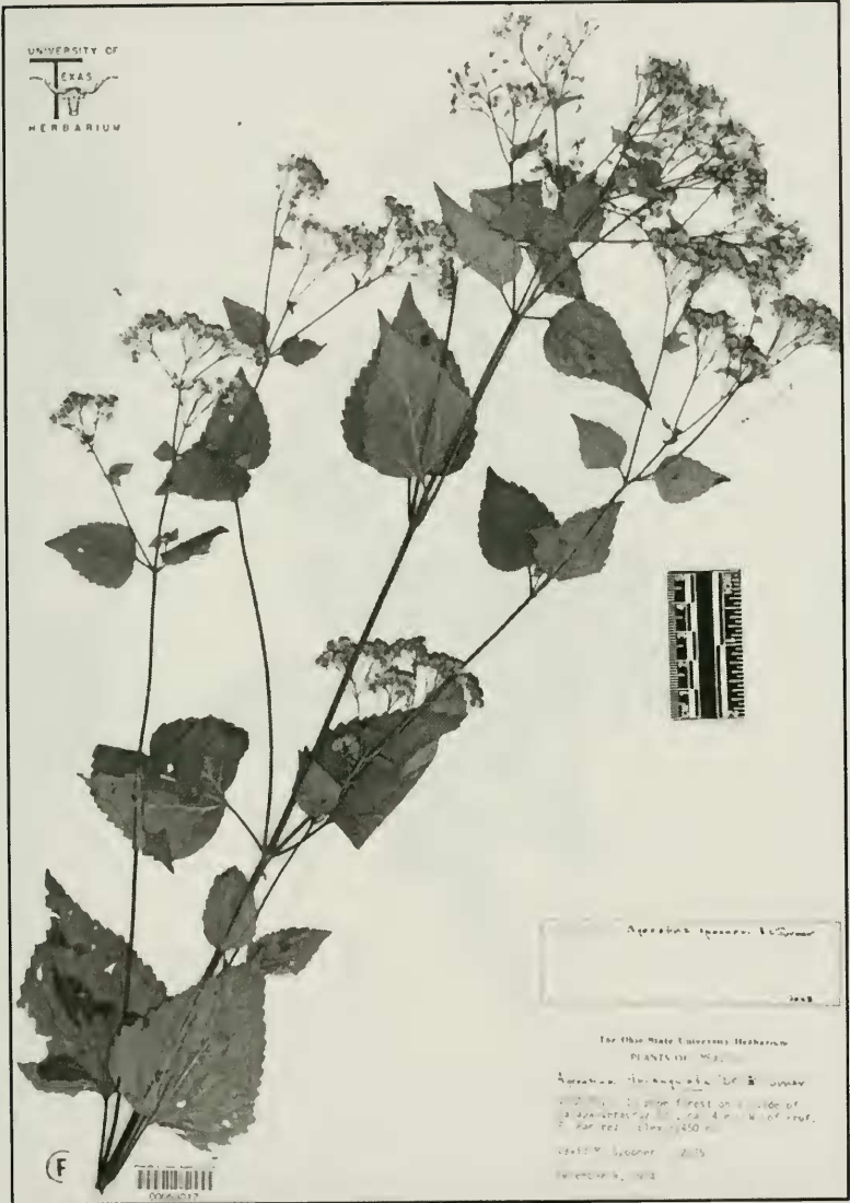
Fig. 5. Holotype of Ageratina spooneri .